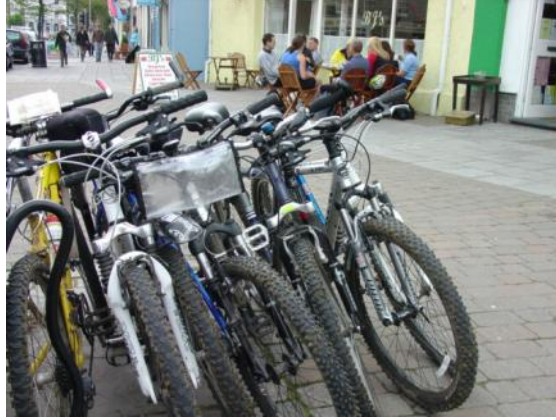
Mountain Bikes in Machynlleth – best practice for racks around town